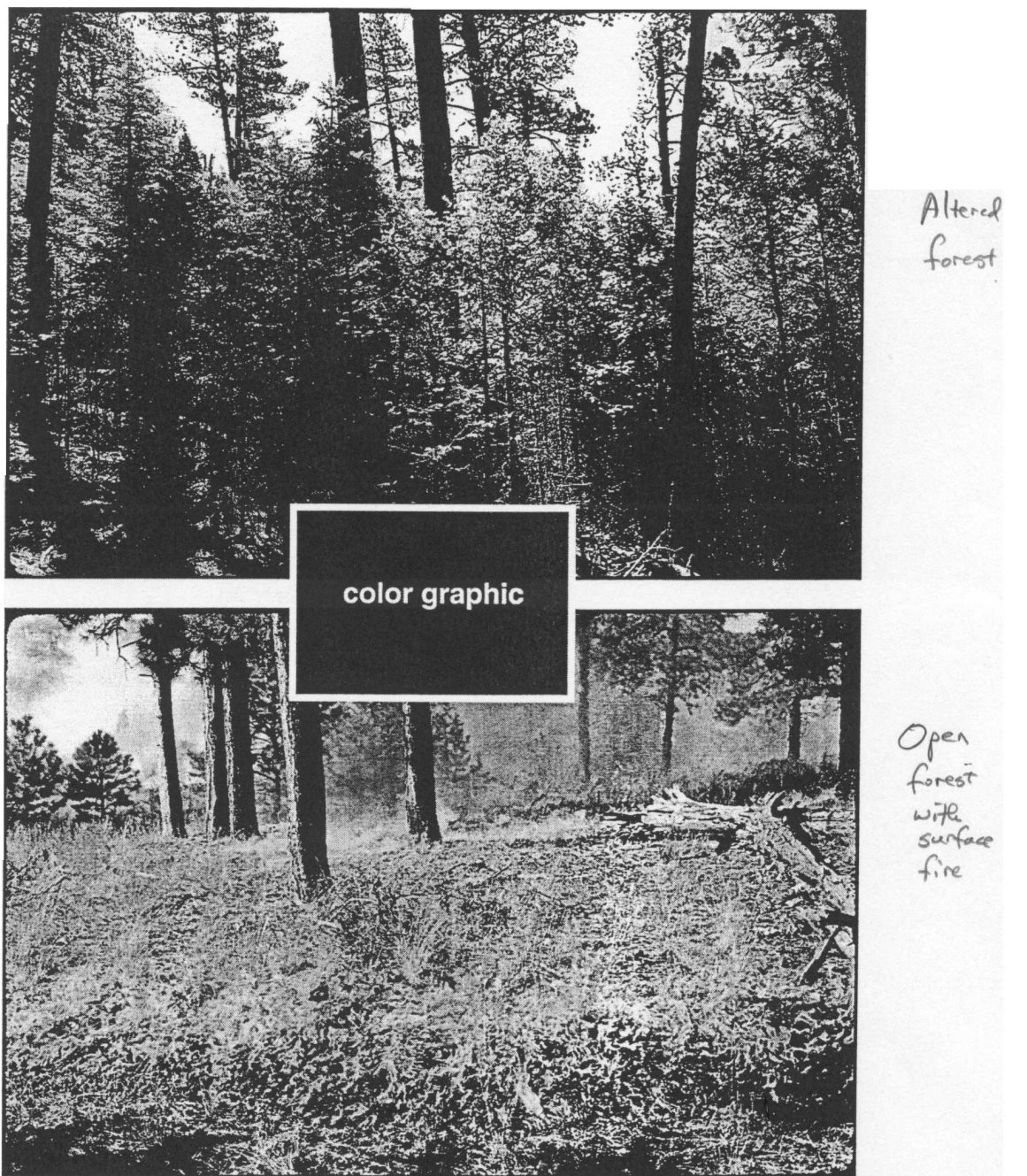
FIG. 1. Ponderosa pine forests of American Southwest. (Top) Open ponderosa pine forest representing "typical" pre-1900 conditions, with grassy understory and surface fire activity. (Bottom) Altered ponderosa pine stand in need of restoration, showing changes in both stand structure and species composition. The dense midstory of mixed conifer trees provides ladder fuels that favor crown fire development.

port the development and implementation of a diverse range of scientifically viable restoration approaches in these forests that address the critical issues of forest heterogeneity, scientific uncertainty, and effects on wildlife. In addition, we suggest principles for ecologically sound restoration approaches. It is not our intention to emphasize a critique of any particular model,