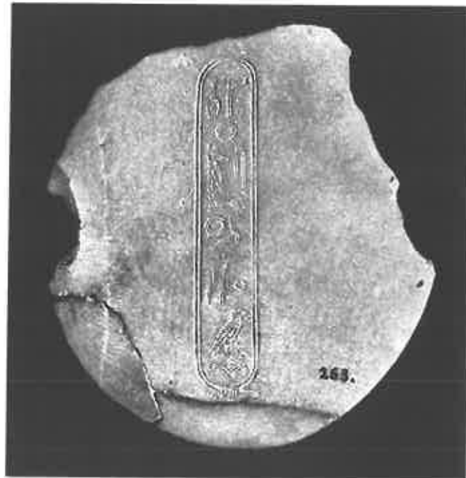
Fig. 36.2 (right). The Khyan Lid (adapted from Warren and Hankey 1989, 244, pl. 14A).