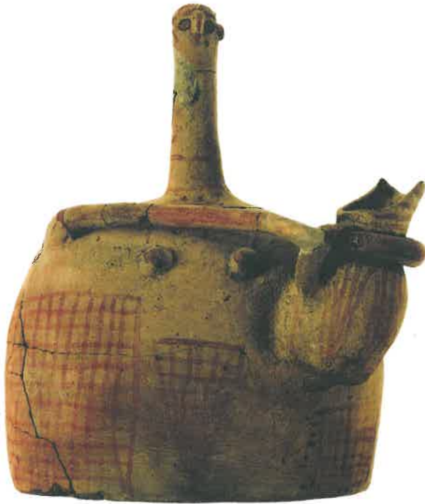
The 'Goddess of Myrtos'. (ANM no. 7719. Photograph courtesy of the 24th Ephorate of Prehistoric and Classical Antiquities, Ayios Nikolaos).