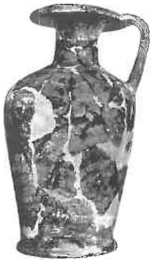
Fig. 36.4. Strap-handled jar from Shaft Grave IV at Mycenae (after Warren 2006, pl. 1A).

gypsum. 111 Attempts to determine the geographical source of alabaster through strontium isotope analysis have begun, with some success stated with regard to distinguishing Egyptian from Cretan alabaster. 112 As a consequence, a stone vase from the Minoan port of Katsambas initially thought by Warren to be Egyptian is now believed more likely to have its origin, in both material and manufacture, in Syria, the Levant, Cyprus or in particular Crete itself. In a number of cases scientific investigation has indicated sources different from those proposed through visual examination. 113