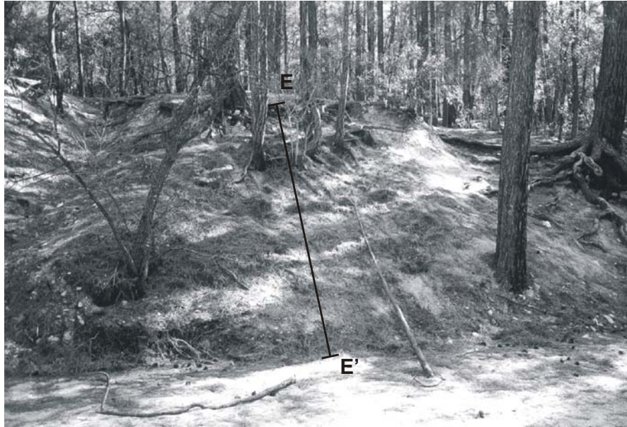
Profile "E" with twisted trees on fallen bank section.