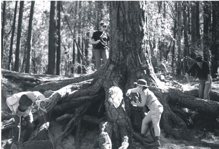
Tree pith >1760