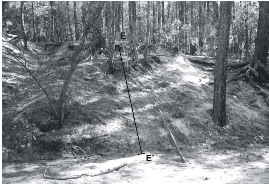
Profile "E" with twisted trees on fallen bank section.